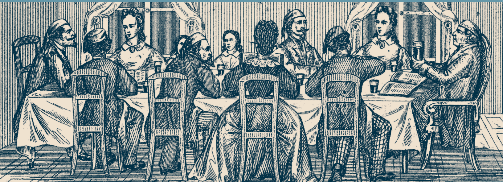
EXHIBIT GALLERY MARCH 7 – JUNE 30, 2016