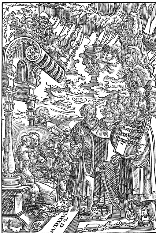
1527 BIBL B