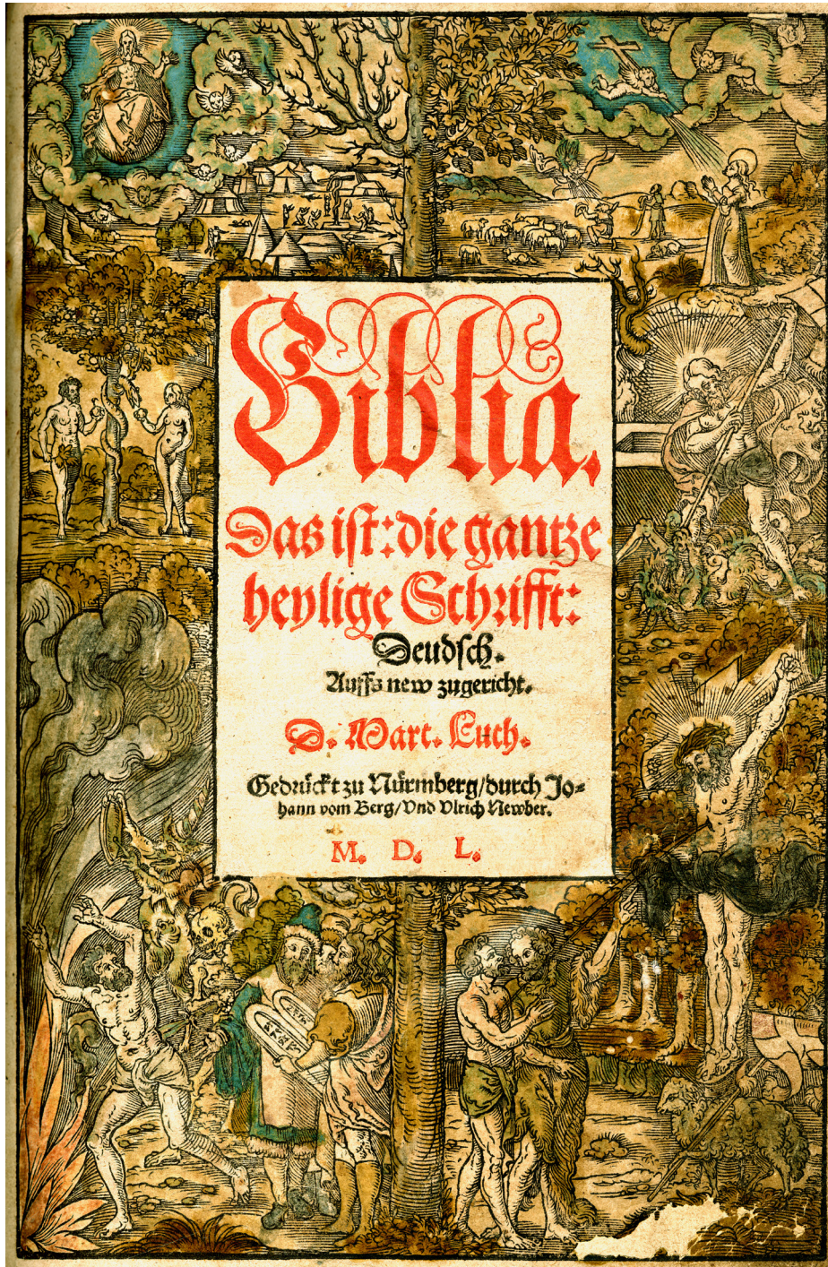
1550 BIBL B