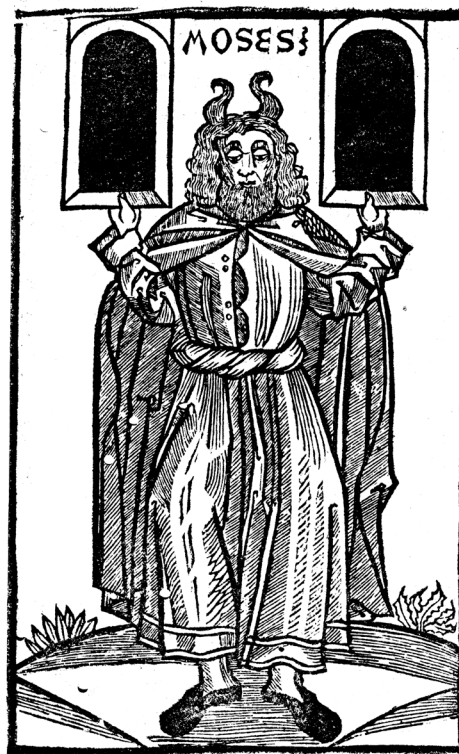
1518 LUTH D