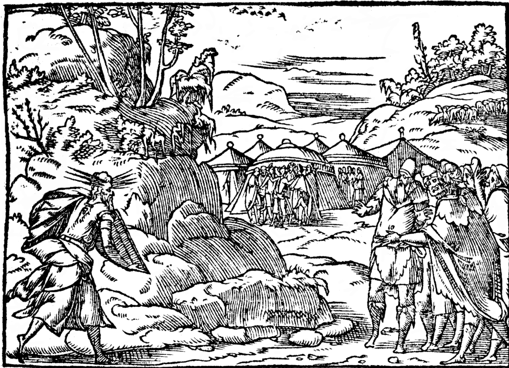
1558 BIBL C