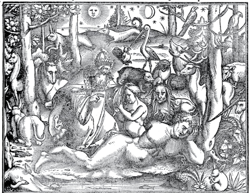
Creation of Eve from the Zurich Bible (1536)