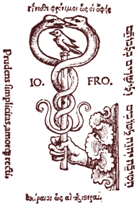
Johann Froben's printer's device from the first edition of Erasmus' Greek New Testament (Basel 1516)

The Digital Image Archive at Pitts Theology Library is a project whose size and value increase dramatically each year. Since I began working with it a year ago, the archive has increased in size by 3,500 images to stand now at more than 20,000, and additional library staff have begun lending their expertise to the effort. The Digital Image Archive team is composed of members with expertise in biblical studies, Christian theology, rare book cataloging, and library metadata standards. Working together, we are able to