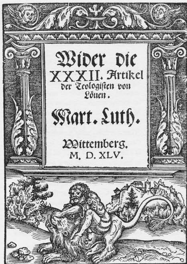
Wider die XXXII. Artikel der Theologisten von Löuen (Wittenberg: N. Schirlentz, 1545)

Both examples show that some title-page illustrations have more than a mere ornamental function and may constitute a theological text in their own right.