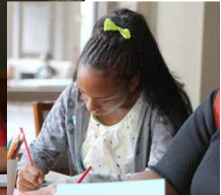
Making books with Kessler Collection woodcuts