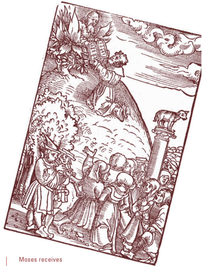
Moses receives the tablets and Israel worships the golden calf. From Luther’s Large Catechism (Wittenberg, 1530).

Martin Luther’s most significant publications on the Ten Commandments are his “Popular Commentary on the Ten Commandments” ( Decem Praecepta Wittenbergensi Praedicata Populo ) and his “Short Form of the 10 Commandments, the Creed and the Lord’s Prayer” ( Ein Kurze Form der 10 Gebote, des Glaubens und des Vaterunsers ). The Kessler Collection